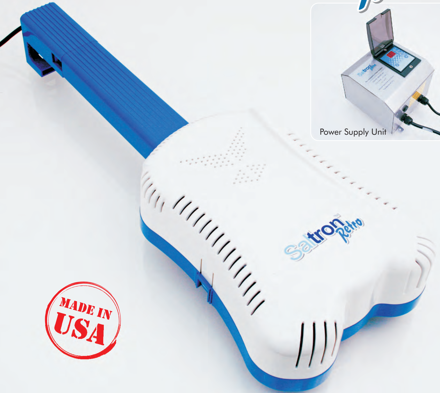
Power Supply Unit

SOLAXX is pleased to introduce the Saltron ® Retro , a salt chlorine generator for inground and aboveground pools.